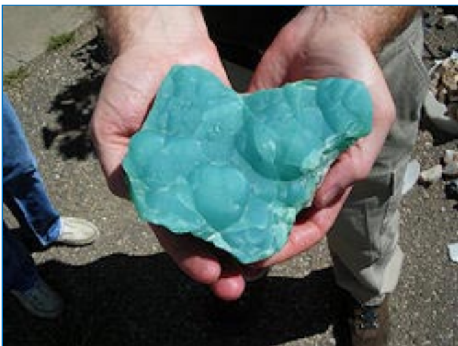
Smithsonite Tony's Rock Shop