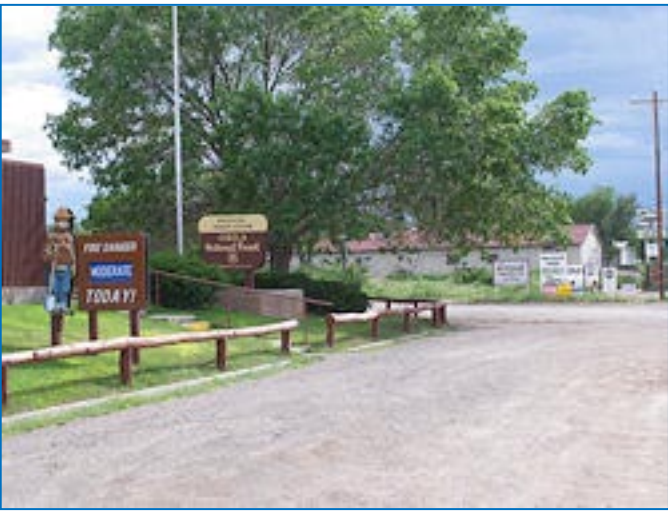
The turn onto Kelly towards Tony's Rock Shop and the mine