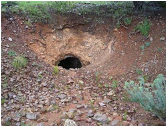
◀ Juanita Mine entrance