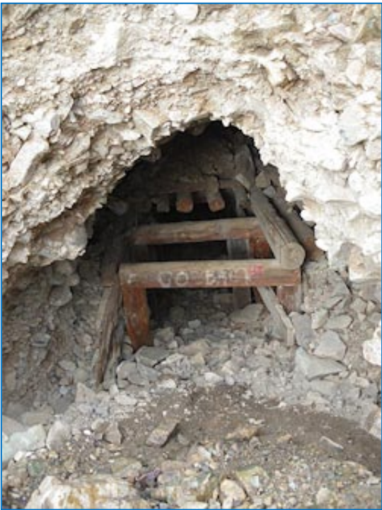
◀ Kelly Mine entrance