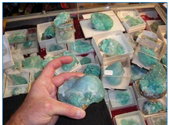
More Smithsonite at Tony's Rock Shop