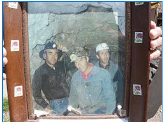
Western Motel, Magdalena, NM