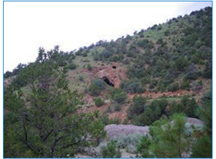
Sunshine Tunnel Stockpile 3