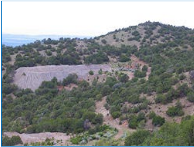
Paschal Stockpile and Head Frame