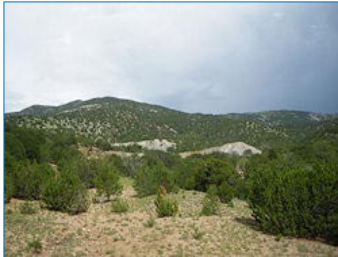
Waldo mine - no trespassing