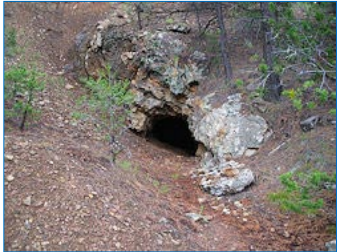
▲ Germany Mine entrance